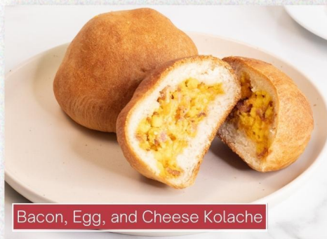
Bacon, Egg, and Cheese Kolache