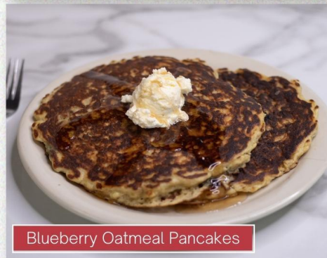
Blueberry Oatmeal Pancakes