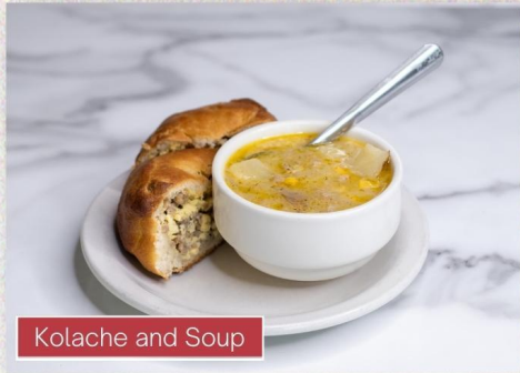
Kolache and Soup